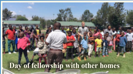
Day of fellowship with other homes

Some of our team members and children from the orphanage participated in a project with another orphanage in Nakuru in order to learn from each