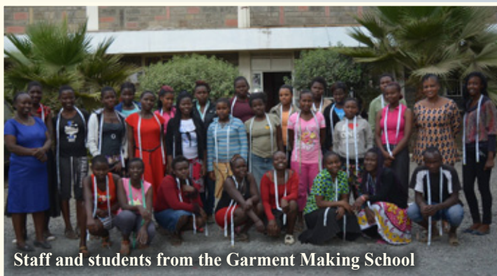
Staff and students from the Garment Making School

For a long time it has been a challenge to supply sufficient water to all the people at the orphanage as well as the additional 600 people from the schools etc. who visit the compound every day. For some time we have discussed the possibility of making our own water drilling at the compound. This is rather expensive but within a few years it should be well paid off, as our water tab already is very high. If you want to make donations to cover this expense please earmark your payment "Well drilling".