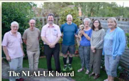
The NLAI-UK board