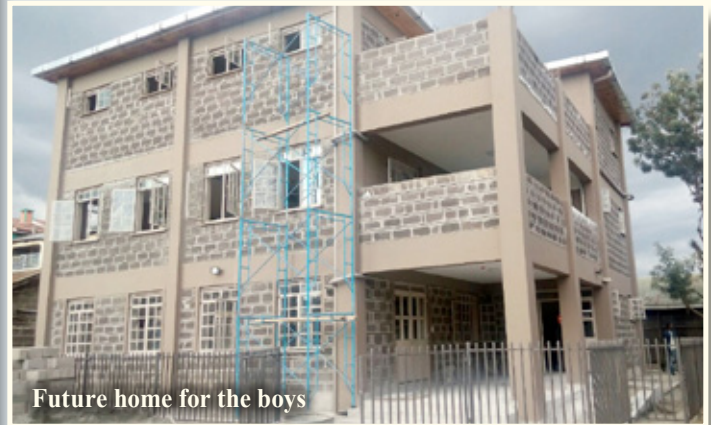
Future home for the boys

The building of the house is almost complete, and the last interior details are now being worked on. The area around the building is