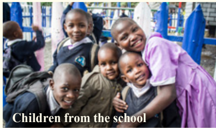
Children from the school

We plan to organise a big end of year Christmas party for all of the students and their relatives in November. More than 1400 people may come to receive a hot meal and a Christmas gift. On the 25th of December we organise a big Christmas party at the orphanage with special food and