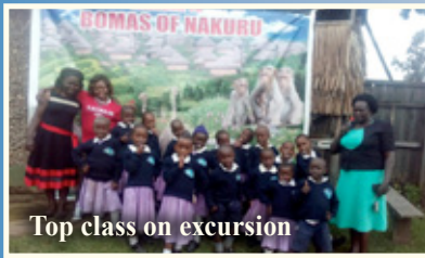
Top class on excursion