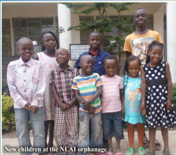
New children at the NLAI orphanage

Within the last few months nine children have moved into the NLAI Homes and they are settling in well. If you would like to become their sponsor, we would love to hear from you.