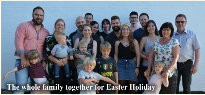
The whole family together for Easter Holiday