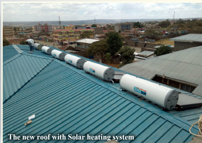
The new roof with Solar heating system