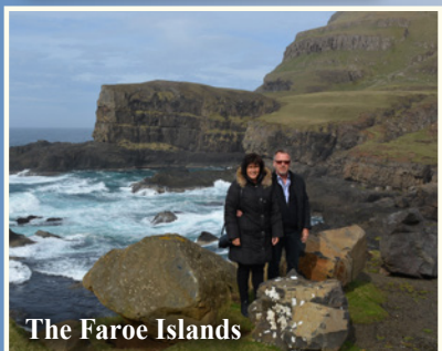
The Faroe Islands

in NLAI, so today we see the Lord's wisdom that he led us to the Faroe Islands almost 20 years ago. We now visit our supporters in the Faroe Islands every two years.