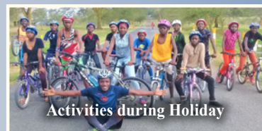
Activities during Holiday

After two to three months of hard work at school, the boys and girls from the New Life Africa International Orphanage again look forward to a more relaxed period together with their house 'fathers' and 'mothers' and other staff at the children's homes. The holidays give opportunities for building closer relationships and exploring new talents. A typical holiday at NLAI includes activities such as cycling, cooking, talent shows, indoor games and outdoor activities such as rugby, football and swimming as well as an Environmental Day where children and staff clean up the surrounding area together. These activities are important, but we are finding it difficult to continue with them. Unfortunately, there are few or no sponsors to fund them. We thank you for all the support we receive for this good cause. We hope to be able to make the children and youths look forward to exciting holidays.