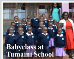
Babyclass at Tumaini School

This year, 24 new students started in high school, so NLAI currently pays for 97 high school students.