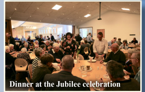
Dinner at the Jubilee celebration