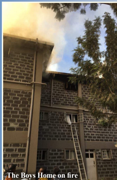
The Boys Home on fire