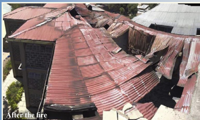
After the fire

whole dormitory along with the boys' private things burned. Most of the roof and all eaves and the entire solar system for hot water, which was installed on the roof, got destroyed.