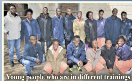
Young people who are in different trainings