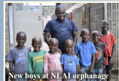
New boys at NLAI orphanage

At present 64 boys have their home in the boys' orphanage. Of these, 40 of them attend the NLAI school and live permanently in the orphanage. Twelve of the older boys from the