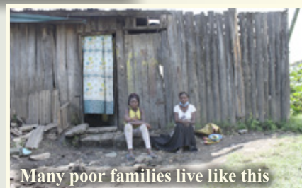
Many poor families live like this

In many of the families that we help, most adults only work from day to day if they are able. Many have lost their jobs because of the corona crisis and are now desperate for food. We know that an even greater burden now has been placed on the poor families as their children cannot go to school anymore where they used to receive a daily meal.