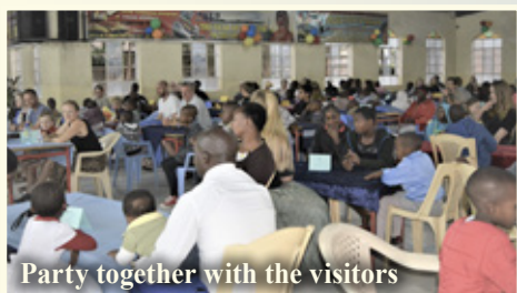
Party together with the visitors

there were many people to greet as well as spending time with the kids and the staff. It was a good time to take up-to-date photos and hand out new school uniform, shoes and bags to all of the children that NLAI supports at the various schools. Many smiles and hugs were given to many children as well. It's a big job, but it means a lot to me to meet with the kids. It helps me to remember what it is all about when I oversee the sponsorships at the office back home in Denmark. In February, we were fortunate that we were allowed to come close to one other, but as long as there is a risk of being infected by the covid-19 virus everyone now has to keep a distance. Whilst there we also joined many gatherings at the orphanage.