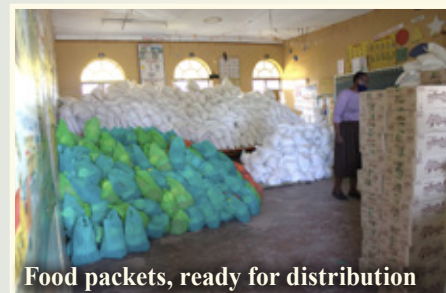
Food packets, ready for distribution

We hope to be able to make a similar food distribution at the beginning of July and August and maybe even for a longer period. Of course, the extent of the distributions will depend on the size of the donations we receive for this purpose.