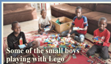
Some of the small boys playing with Lego

the orphanage, who are grownup, study and live in a dormitory having their expenses financed by NLAI.