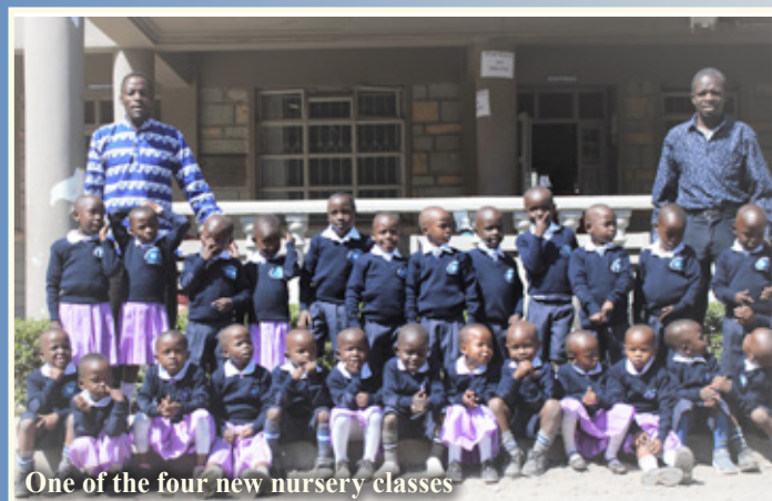
One of the four new nursery classes