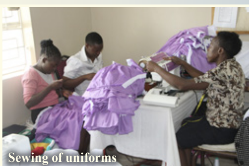
Sewing of uniforms

We visited school classes and met up with the young people in further education. It is encouraging to sit and listen to their life stories about how they came to NLAI many years ago and how many are now finishing school and high school and now moving on with a range of further education. To hear and witness what faith means to them and to see how