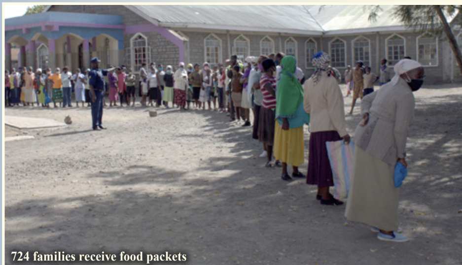
724 families receive food packets

All of the NLAI staff are still receiving their salary and food packages have been provided for 724 families who have a child or teenager in school, supported by NLAI.