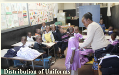
Distribution of Uniforms

they have grown in every aspect of their lives - both physically, mentally and spiritually - evokes great thanks to God for each one of them. From a point where their lives were about to fail they are today by the grace of God independent young people who stand with faith in their hearts and are ready to move on in life. Thank you so much to everyone who prays for them and financially supports them. It is amazing and we are deeply grateful.