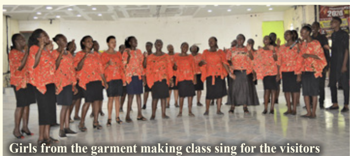
Girls from the garment making class sing for the visitors