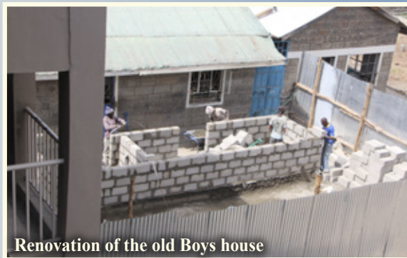
Renovation of the old Boys house

At present, the old boys' house is being renovated and additional bathroom facilities and toilets build in preparation for the girls to stay there temporarily while the girl's home is undergoing major renovations.