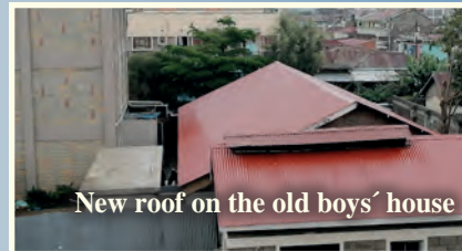
New roof on the old boys' house

Over a long period, we have been writing about and raising funds for a new water tower and for the renovation of the Girl's House which is very worn. As the girls' house is about to go through a major renovation next year including new water pipes and a new roof, we have also decided to make a stronger roof construction that can bear the solar heating systems for hot water so that the girls can get hot water for bathing. All water pipes in the girl's house must be replaced as there have been several water leaks which have caused damage in the house, and have to be repaired. To get the full benefit of the solar energy for hot water we must build a water tower that is higher than