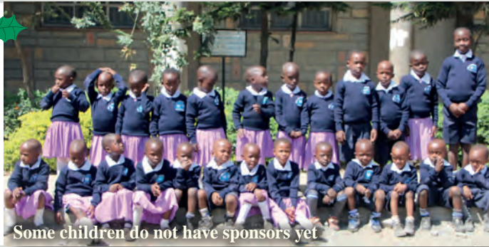
Some children do not have sponsors yet

We still lack sponsorships for children at the school, the orphanages and young people. Some only need $ 16, others need $ 57 and some need larger amounts to cover their expenses. If you would like to make a difference in the life of a child or young person please contact us at newlifeafricainternational@gmail.com It means a lot for the children and young people to feel the act of love, that someone somewhere else in the world wants to help him or her.