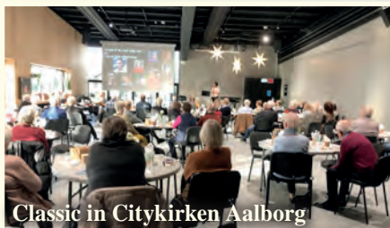
Classic in Citykirken Aalborg

A planned trip to the Faroe Islands in October had to be cancelled due to covid-19. At the beginning of November, we held a meeting for seniors in the Apostolic Church in Aalborg. At the end of November, we spoke at "Classic," which is the name of a group