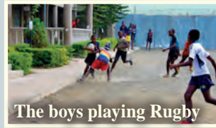
The boys playing Rugby

The children have learned new things within areas such as food, sewing, knitting, drawing, singing and dancing and have spent time reading books and the Bible. The atmosphere in the homes has been cheerful with anticipation that things will soon be better so that they will be able to return to school.