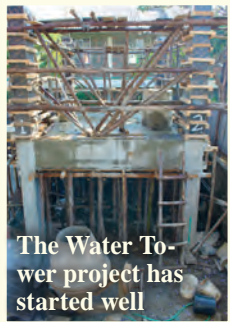
The Water Tower project has started well

Over a long period, we have been writing about and raising funds for a new water tower and for the renovation of the Girl's House which is very worn. As the girls' house is about to go through a major renovation next year including new water pipes and a new roof, we have also decided to make a stronger roof construction that can bear the solar heating systems for hot water so that the girls can get hot water for bathing. All water pipes in the girl's house must be replaced as there have been several water leaks which have caused damage in the house, and have to be repaired. To get the full benefit of the solar energy for hot water we must build a water tower that is higher than