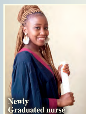
Newly Graduated nurse