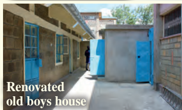
Renovated old boys house

the girl's house in order to provide water pressure for the solar heating system. The construction of the water tower is well underway and is expected to be completed in January 2021. As it is not possible to live in the girls' house during the renovation work we have restored the old primitive boys' house and built several additional toilets so that the girls can live in the house temporarily while the girls' house is being restored in 2021.