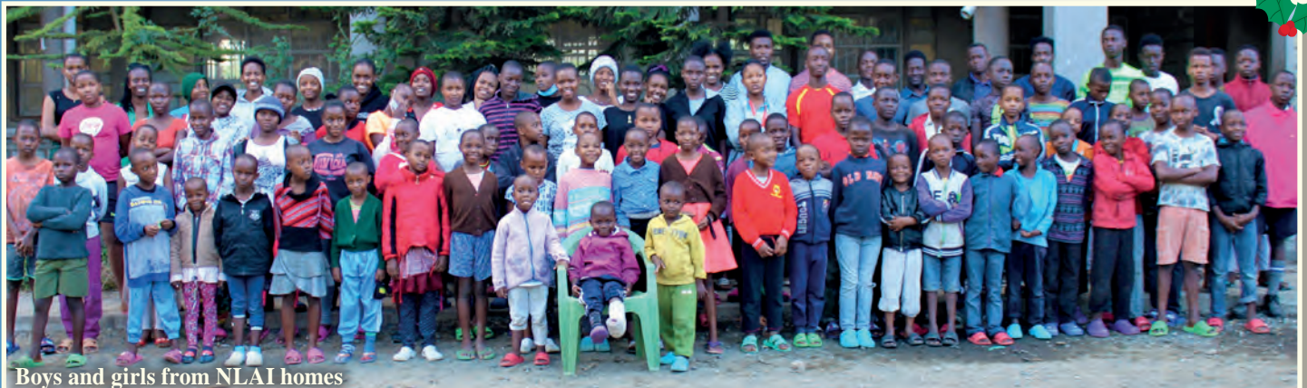
Boys and girls from NLAI homes

Would the restrictions of the number of freedom of assembly cause the orphanages to close?