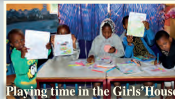
Playing time in the Girls' House

This ensured that the children had all their needs provided for, both food and clothes as well as means for games and accessories for creative purposes which helped to fill up a long period of time away from school. Thank you for helping lift this burden in an incredible way even though you are far away. The provision