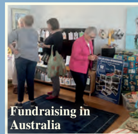
Fundraising in Australia

In Australia, friends of NLAI have collected approx. US 2700, to help finance a solar heating system for the girls' house simply by inviting friends and acquaintances to "morning tea" and selling handmade items and things for Christmas.