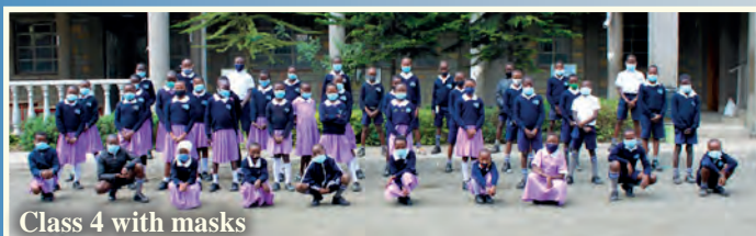
Class 4 with masks

In October, the government permitted all the students from the 4th and 8th classes to attend schools. The plan was to see how things would develop and to see if it would be possible to reopen all school classes by January 2021.