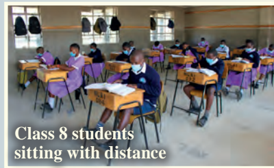
Class 8 students sitting with distance

start and repeat their classes as the school year has been shortened. Children and teachers in schools have to wear masks, wash and spray their hands and keep a proper distance. We thank God that to date no one from the school in New Life Africa International has been infected by covid-19. Please pray that everything will go smoothly when all school classes resume on January 4, 2021.