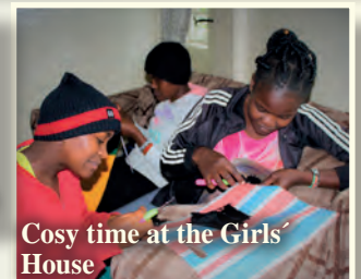
Cosy time at the Girls' House

has given us peace of mind as we see the children being able to learn new things and being active in so many ways. The children had a good time reading the Bible and learning more about the goodness and provision of God for all of us. We must say that our faith and trust in God has grown through this difficult time.