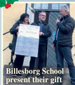
Billesborg School present their gift

coffee and food. The efforts resulted in a total amount of USD 13500 being raised. This was used to purchase food to distribute to 724 poor families in Kenya that NLAI are in contact with through the schools. Thank you so much for all of your great contributions. They have made a huge and remarkable difference to needy families in a difficult time. As the opportunities to hold meetings have been reduced this year, we are grateful to see how God has provided means of support for NLAI to help so many people in different ways.