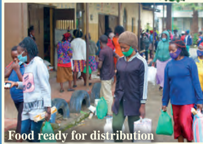
Food ready for distribution

The schools will open for all classes in January 2021 and the school will provide the children with two meals a day. As many of the families suffer from unemployment, there will still be a need for distribution of food packages. Providing the necessary funds are available, we want to continue to provide relief in this way. We have been told that in Nakuru NLAI is the only organization that still distributes food every month.