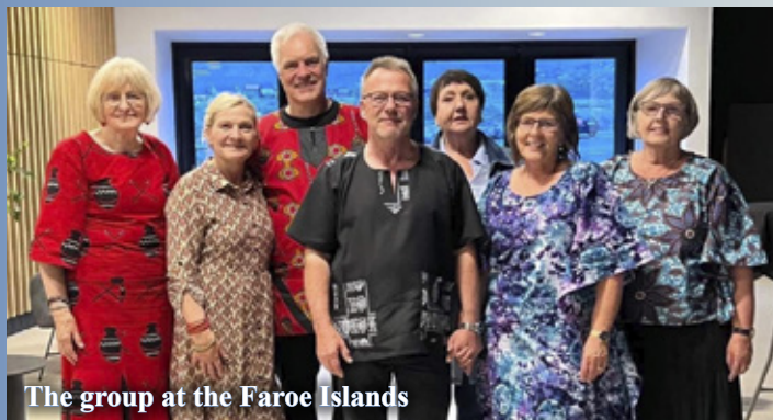
The group at the Faroe Islands

From 9 – 21. June, we took a meeting trip to the Faroe Islands and we visited 8 different churches and congregations, as well as making many private visits