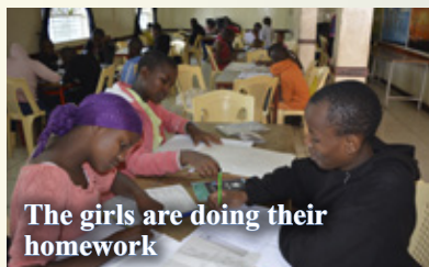
The girls are doing their homework

This help contributes to ensure that the girls have a home where they receive love, food and drink, clean clothes, health checks and medicine. In addition, they receive advice and guidance where they learn about basic life necessities.