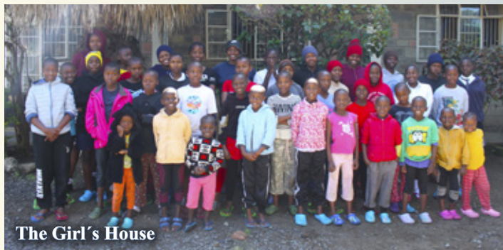
The Girl's House

50 girls inhabit the girls' house of whom 70% are orphans. The remaining girls come from backgrounds with dire challenges in the family due to alcohol or incest, which makes it unbearable to live at home.