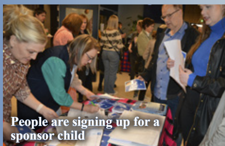
People are signing up for a sponsor child

From 9 – 21. June, we took a meeting trip to the Faroe Islands and we visited 8 different churches and congregations, as well as making many private visits